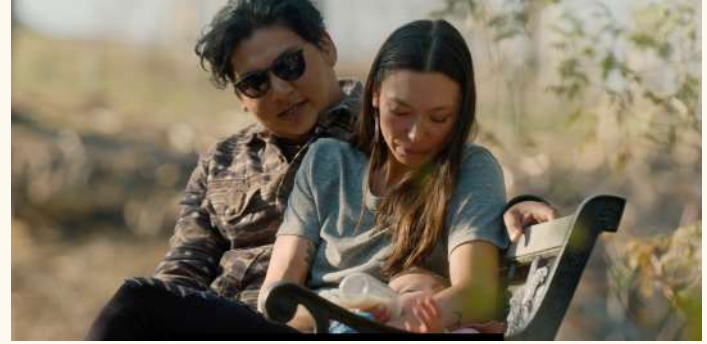
Still from CBD featuring Indigenous activist Sarain Fox

The film also meets youth at the centre of the climate moment. A growing number of Gen-Z and millennials are either refusing to bring a child into an increasingly unstable world or struggling with the question of whether they should.